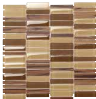
30x30 0618/RG41 HONEY ND

LEGGERE LA PREMESSA READ THE FOREWORD LIRE L' INTRODUCTION LESEN SIE DIE VORWORT