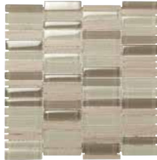
30x30 0618/RG10 PEARL ND