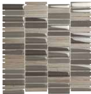
30x30 0618/RG38 GREY ND